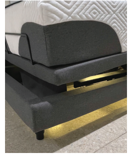
Under bed night lights