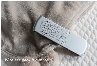
Wireless backlit remote

USB Power Ports: Connect two USB chargers on each side of the base for powering your devices while you relax or sleep.